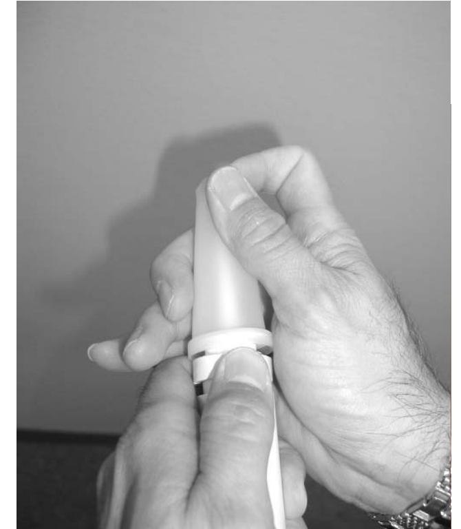
Step 4: While maintaining pressure on the seal pin apply an upward force to close the cap. Rotate the syringe 180 degrees and repeat steps 3 and 4.