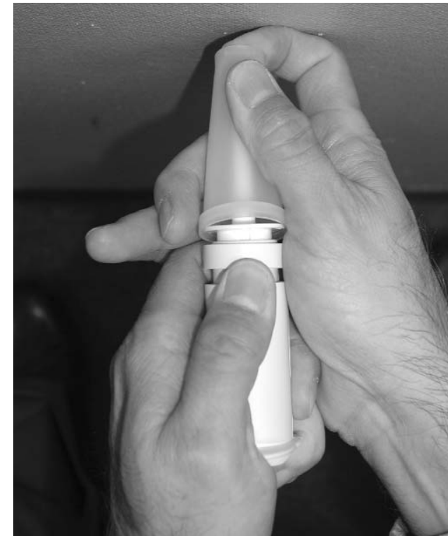
Step 3: Apply downward force with your thumb to create an opening 2/8 to 3/8" to view base of syringe tip and inspect for crack. Adjust angle to give best view of syringe tip.